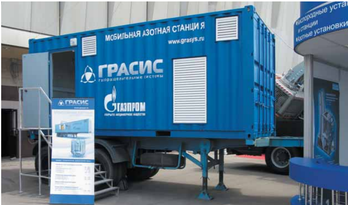
Customer: OJSC Gazprom Capacity – 180 nm 3 /hr, nitrogen purity – 95%