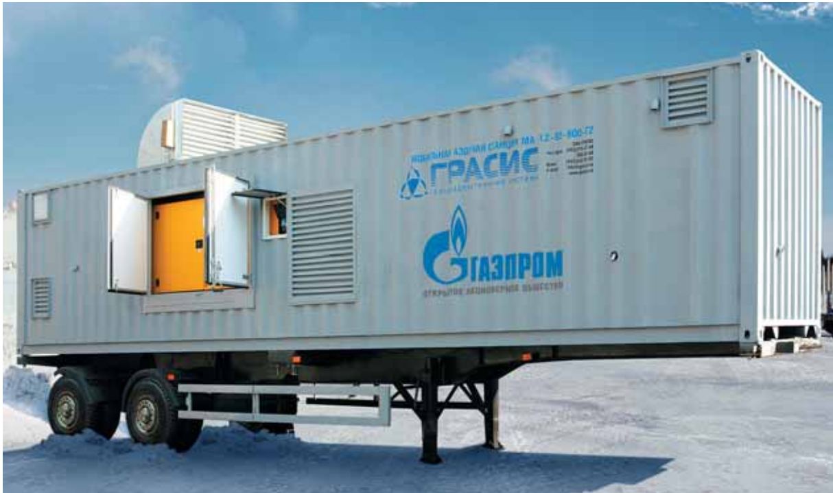
Customer: OJSC Gazprom Capacity – 600 nm 3 /hr, nitrogen purity – 95%