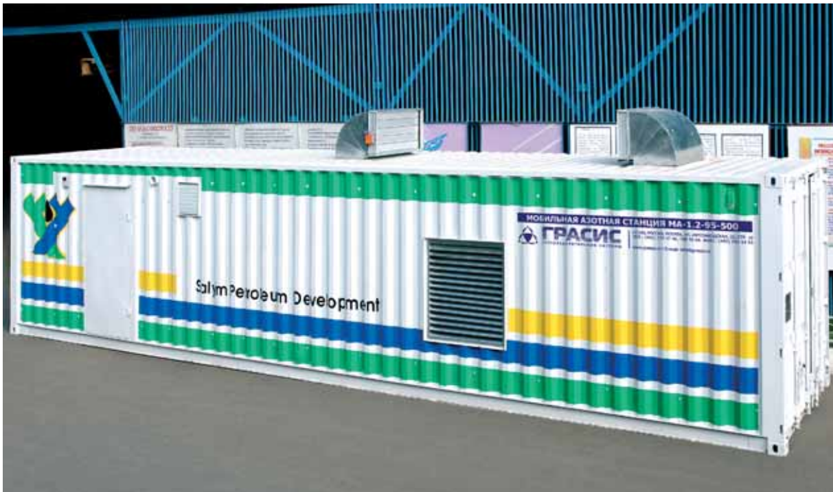
Customer: Salym Petroleum Development N.V. Capacity – 500 nm 3 /hr, nitrogen purity – 96%